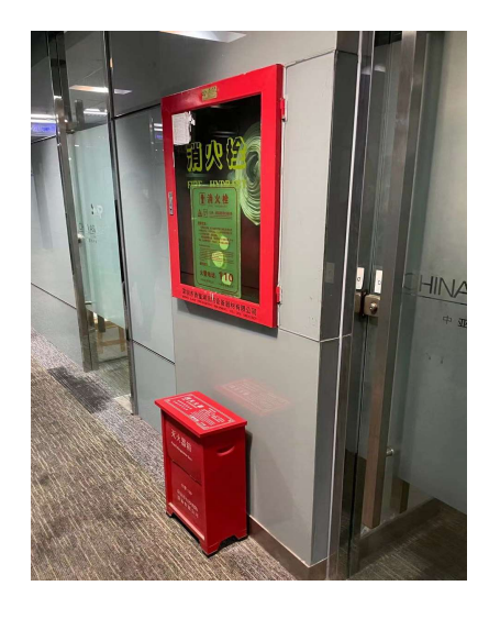
Fire safety equipment installed in the service site in Shenzhen

On the other hands, the relevant managers and supervisors attend the occupational safety and health seminars organised by government departments or other organisations to obtain the latest safety statutory requirements and new information in respect of safety and health management, risk assessment and industrial safety. Through the practice of "Train the Trainer", the management holds four safety sharing sessions every year to share relevant insight and knowledge of safety management, as well as exchanging experience with its employees to reduce the safety risks of employees and increase their safety awareness in daily activities.