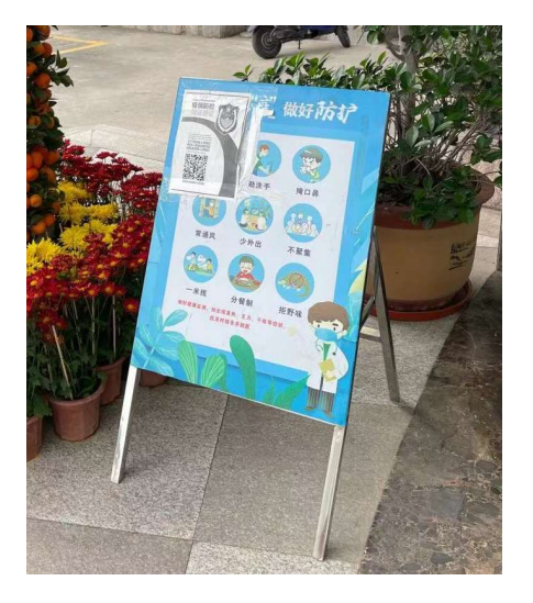
Notice board for promoting personal hygiene protection in the service site in Shenzhen