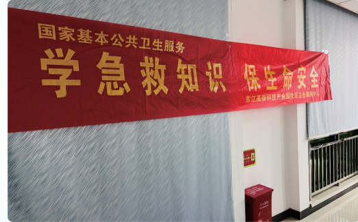
Conducting medical emergency knowledge training. 進行醫療急救知識培訓。