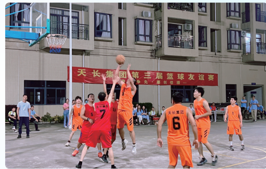
Organising the 3rd Annual Basketball Friendship Tournament for all employees. 舉辦第三屆全體員工籃球友誼賽。