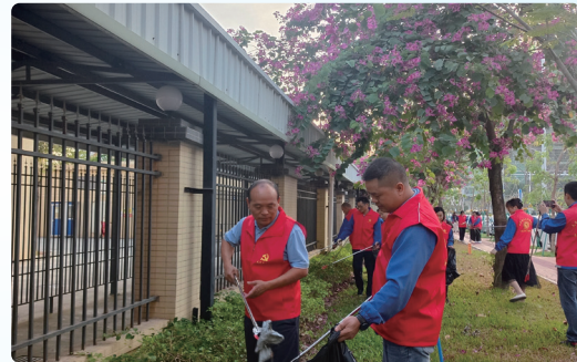
Organising a "Trash Run" activity for all employees. 組織全體員工進行檢跑活動。