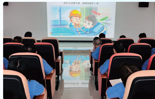
Conducting occupational injury prevention training. 進行預防工傷培訓。