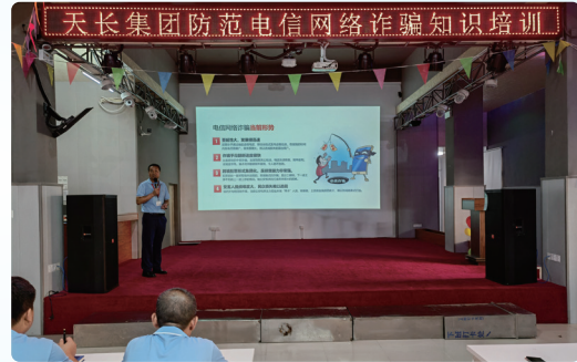
Conducting anti-fraud training. 開展反詐騙培訓。