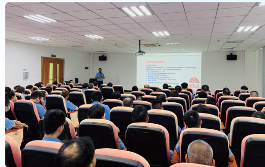
Conducting occupational safety training. 開展職業安全培訓。