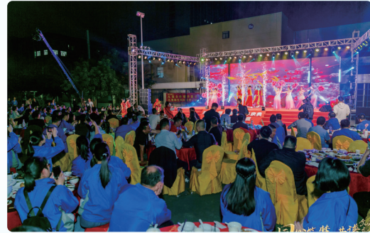
Organising a 2023 New Year celebration event for employees. 為員工舉辦 2023 年新年慶祝活動。