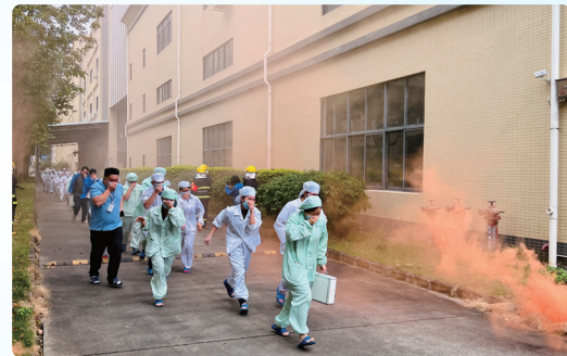
Conducting comprehensive fire drill. 開展綜合消防演練。