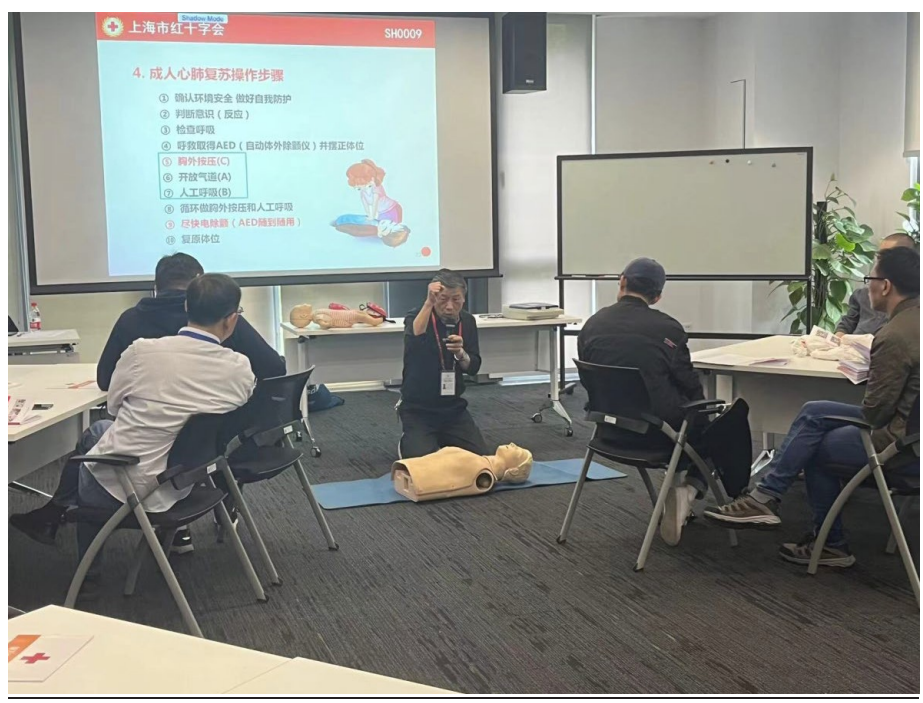
Red Cross First Aid Training