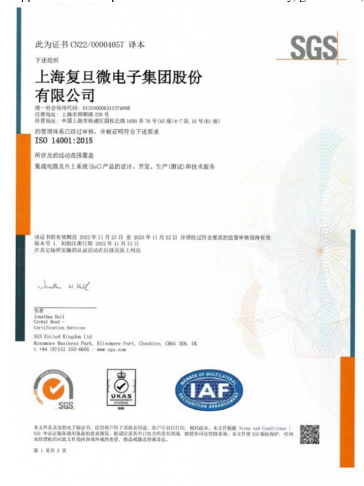
ISO14001 Environmental Management System Certificate Certificate

The Company signed the "CSR Behavioural Commitment for Suppliers" with suppliers to promote the fulfilment of suppliers' social responsibilities in the areas of society, governance, energy saving and emission reduction.