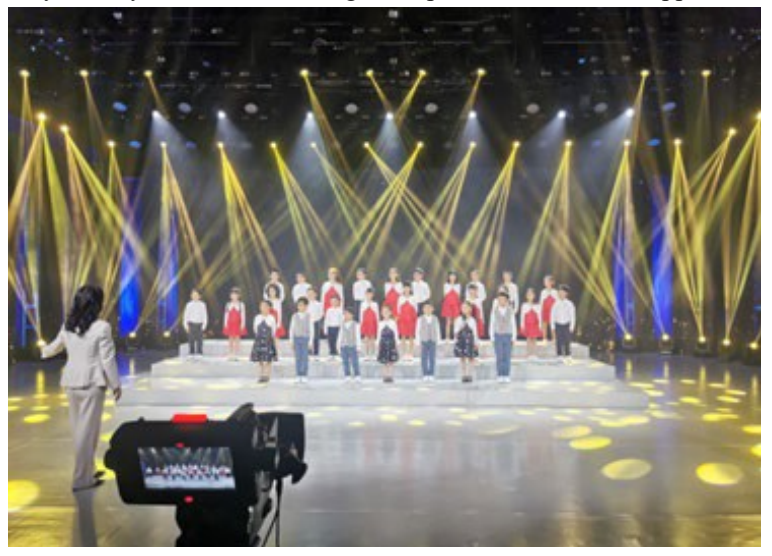
"Baby Snail Choir" on the show

In 2023, Fudan Microelectronics contributed RMB83,809 to continue to fund the "Hearing Impaired Children's Choir Project ". To help children with hearing impairment grow up healthily, Fudan Microelectronics joined with the Shanghai Rehabilitation Centre for Deaf Children, Shanghai Conservatory of Music and China Construction Bank Shanghai Branch in 2019 to establish Shanghai's first choir of children with hearing impairment, the "Snail Baby Choir". Professional vocal teacher will provide weekly training on music knowledge and skills, as well as rehearsal of choral songs. Since the launch of the project, the choir has performed at the Maryland Theatre, the White Magnolia Theatre, the "Blue Sky Charity Gala" and the "National Ear Care Day Charity Concert", receiving widespread attention and support from the community.