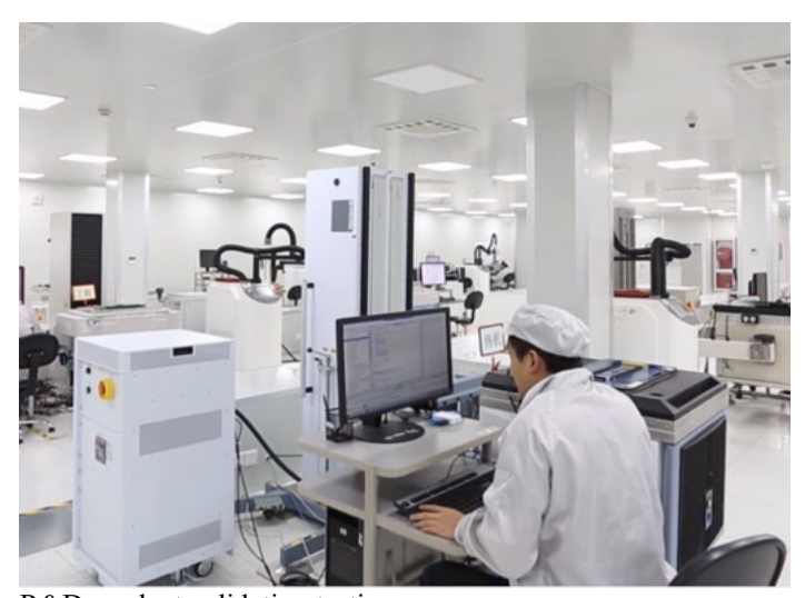
R&D product validation testing