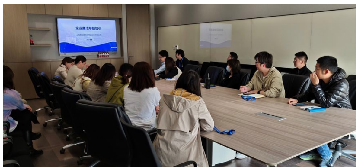
Corporate Integrity Training

Responsible mineral procurement: The Company always attaches importance to fulfilling social responsibilities and opposes mineral transactions that may seriously violate human rights. The Company undertakes that the metals used or contained in all products and their packaging do not come from "conflict minerals".