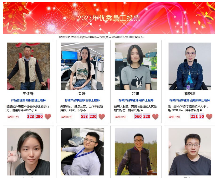
Selection of Outstanding Employees