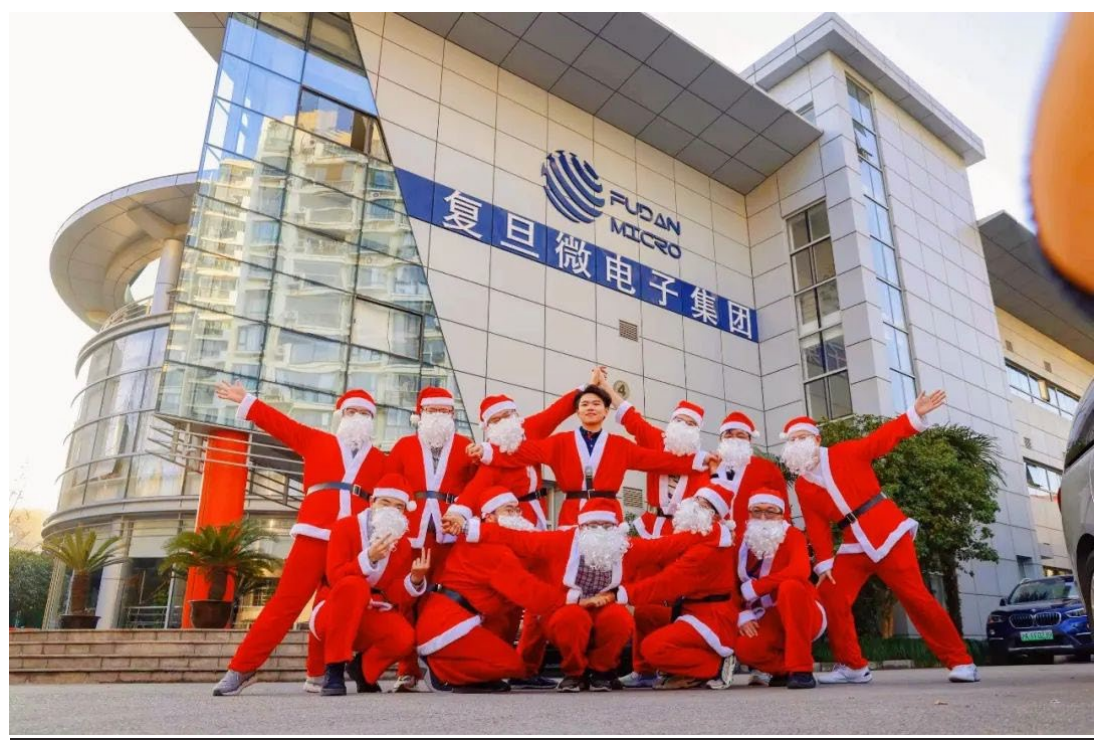
Company Christmas Activities