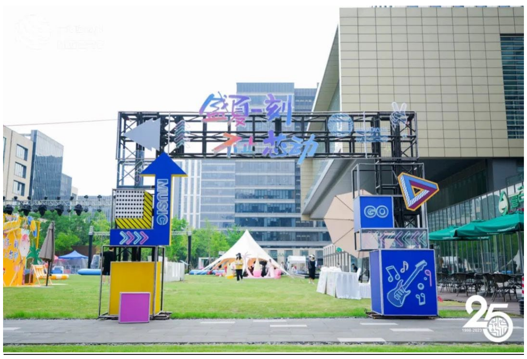
Company Anniversary Celebration

The Company launches different activities to increase staff cohesion.