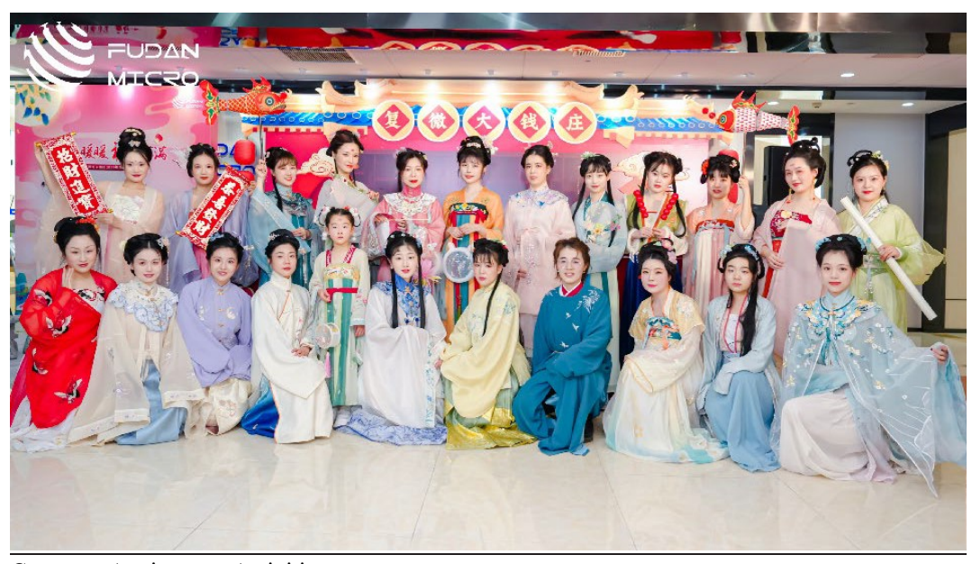
Company Anniversary Activities