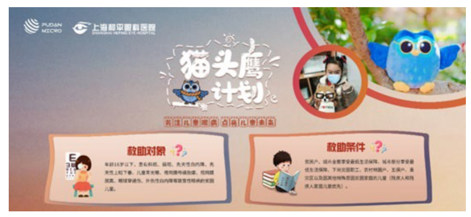
Owl Babies Rescue Targets and Conditions

Children carry the hope and future of a family. In order to alleviate the financial burden of treating children with eye diseases from poor families, improve the problem of children's eye diseases, enable early detection, early intervention and early treatment of children's and adolescents' eye diseases, and improve the overall standard of children's and adolescents' vision health. In 2022, Fudan Microelectronics invested RMB250,000 to join hands with Shanghai Heping Eye Hospital to launch the "Enlightenment Core Project" to care for children with strabismus, amblyopia, congenital cataract, congenital ptosis, childhood glaucoma, retinoblastoma, retinal detachment, penetrating eye injury, traumatic cataract and other blinding eye diseases across China. For every child with the condition to have a bright, healthy pair of eyes and a brighter future, just like Baby Owl.