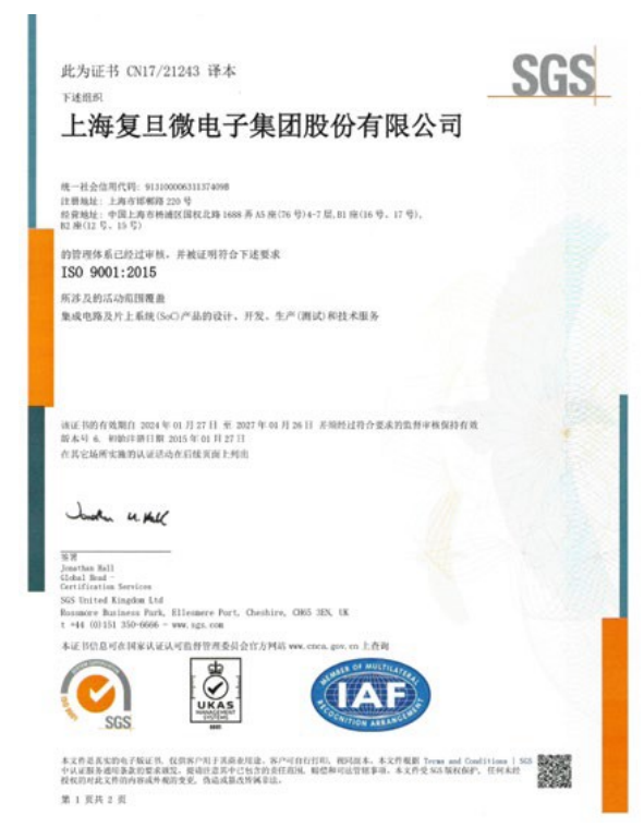
Quality Control System Certification

The Company strictly complies with domestic and foreign laws and regulations and quality control system standards, continuously improves technology and product quality, establishes a perfect quality control system, and devotes itself to the quality control of the whole product life cycle to ensure that we can provide our customers with products that satisfy their expectations and needs.