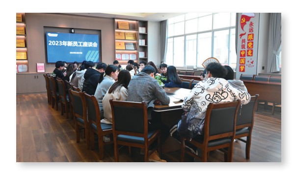
2023 New Staff Seminar

In addition, the Group proactively encourages our employees to attend seminars, sharing sessions and relevant courses organised by professional institutions through various incentives such as examination leave and cash subsidies