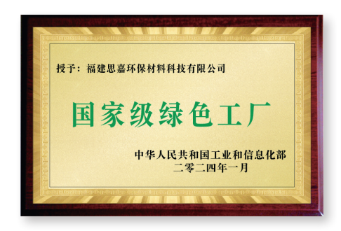
National Green Factory