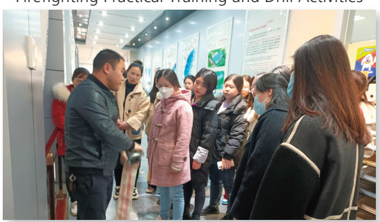
Training on the Use of Firefighting Equipment and Fire Hoses etc.

In addition, to further protect our employees' health, we have implemented a smoke-free workplace policy which prohibits smoking within the workplace. We have also established an annual smoking cessation award to encourage employees to quit smoking. During the Reporting Period, we also provided health advisory services, allowing employees to receive professional health consultations. These initiatives reflect our commitment to employee health and our ongoing efforts to create a safe working environment.