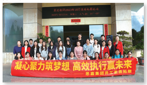
Employee Quality Enhancement Parade Activity

During the past three years including the Reporting Period, the Group did not have any cases of work-related fatalities. During the Reporting Period, the Group lost a total of 923 working days due to work-related injuries, all of which were properly handled in accordance with the above procedures.