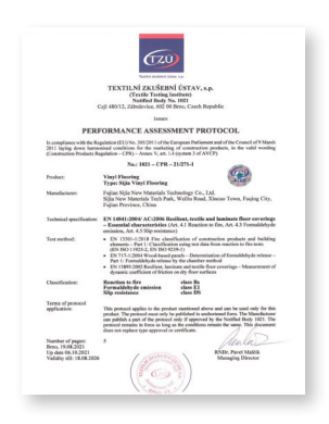
European Union CE Certification