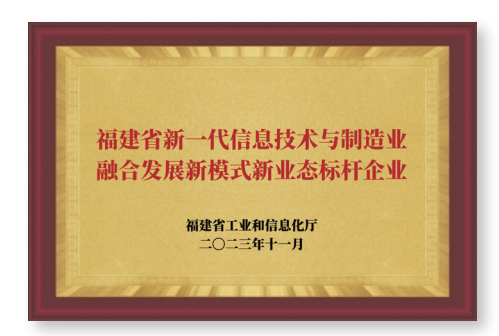
Fujian Province's New Generation Benchmark Enterprise of Integrated Information Technology and Manufacturing Development Business Model (福建省新一代資訊技術與製造業融合發展新模式新業態標杆企業)