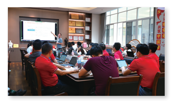
1st Training Conference for Senior Management and Key Personnel