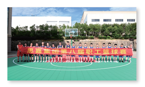
Fujian Sijia 8th Staff Basketball Tournament