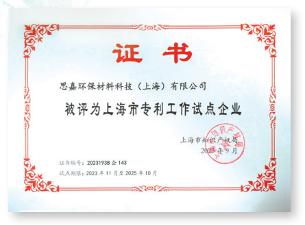
Shanghai Patent Work Pilot Enterprise