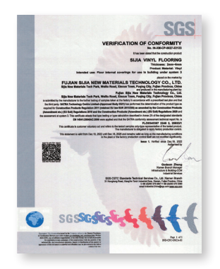
The UK UKCA Certification