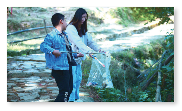
Eco-friendly Hiking Activity

During the Reporting Period, the Group organized employees to start an eco-friendly hiking event titled "Energy Saving and Low Carbon, Together We Go (節能低碳·你我同行)" which received enthusiastic response from the employees, with over 30 registering for participation. The event took place along the scenic trails of Jianghu Village in Fuzhou, where participating employees walked the historic path, enjoyed natural beauty while engaging in environmental cleanup by picking up litter along the way. This kind of activity does not only help to improve the physical fitness of our employees but also directly involves them in actual environmental protection actions, bringing both health and ecological benefits. We also hope to encourage employees to cultivate eco-friendly habits in their daily lives, further advancing the company's overall environmental culture and sense of social responsibility.