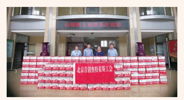
Beijing Capital Outlets donated disaster relief materials

In the summer of 2023, Beijing experienced continuous heavy rainfall, causing severe flooding in multiple villages in Shilou Town, Fangshan District, resulting in water and power outages, road interruptions, and severe damage to local villagers. Beijing Capital Outlet, as a key commercial enterprise under the municipal government of Beijing, actively responded to the call of the district government to donate funds for disaster relief, donating disaster relief materials to Shilou Town, Fangshan District, and practicing corporate social responsibility.