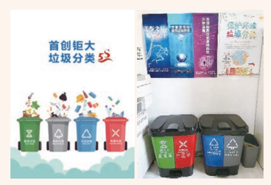
Garbage sorting containers and signs

Each outlet project classifies waste according to local government requirements and is equipped with corresponding waste sorting facilities. Recyclable waste such as waste paper is handed over to local recyclers for recycling, and a small amount of hazardous waste such as discarded fluorescent lamps are temporarily stored in special bins and disposed of harmlessly by suppliers on a regular basis. To enhance employees' understanding of garbage classification knowledge, we encourage more employees to participate in garbage classification actions, advocate for a civilized culture of caring for nature, conserving resources, and caring for the environment.