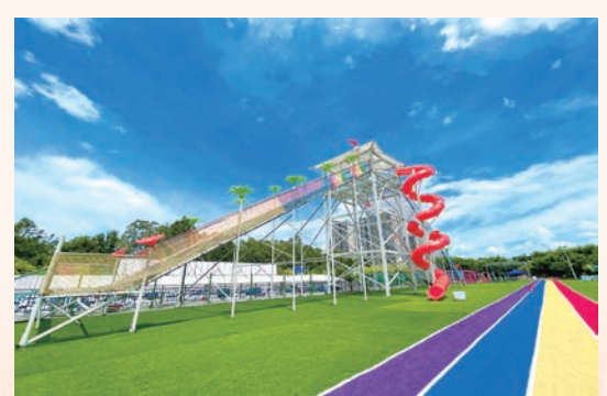
Capital Outlets Park in Nanning