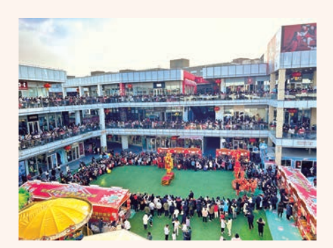
The Spring Festival events held by Beijing Capital Outlets

Capital Outlets continued to unleash the commercial potential in many cities across the country, leading the upgrading of local consumption and lifestyle. Based on the solid foundation of strategic layout, through the unified marketing strategy of "Super Decade" and "Celebrating in 15 Cities", Capital Outlets focused on traditional festivals, deepened the core value of the themes of events, strengthened communication and interaction with consumers, and promoted innovative breakthroughs in marketing models.