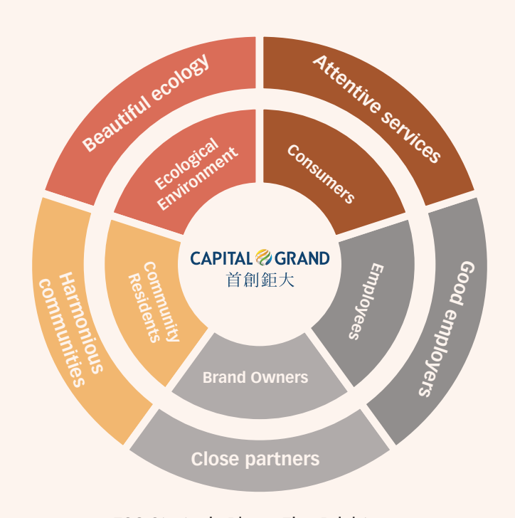
ESG Strategic Plan – Five Brightness