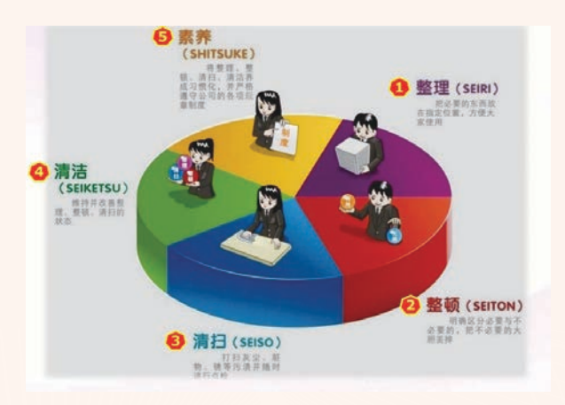
5S environmental management concept

We comprehensively promote the 5S (Seiri, Seiton, Seiso, Seiketsu, Shitsuke) environmental management concept and have initially formed a 5S governance plan. We will popularize relevant provisions in laws and regulations such as the Environmental Protection Law (《環境保護法》) and the Energy Conservation Law (《節約能源法》) to employees in an easy to understand form, strengthen their awareness of environmental protection and resource conservation, and promote everyone's participation in green office practices.