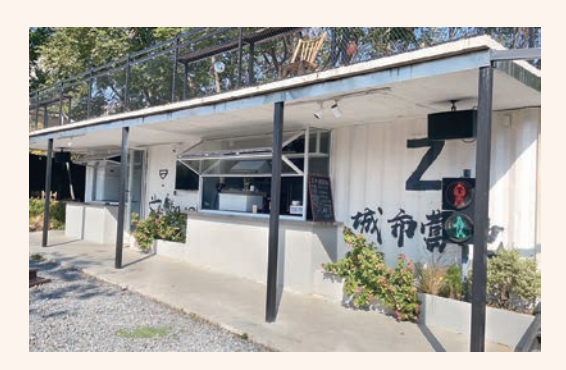
Huzhou Capital Outlets introduced B&B, banquet hall, outdoor coffee