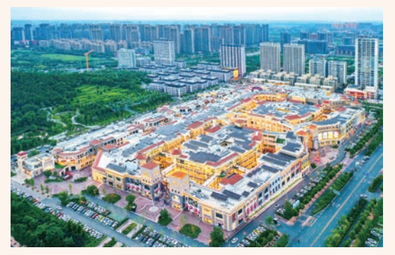
Photovoltaic power generation system of Jinan Capital Outlets

Jinan Capital Outlets achieved a total photovoltaic power generation of 1,264,700 kWh, saving electricity by 220,000 kWh, reducing carbon dioxide emissions by 653.52 tons, and earning an annual income of RMB163,000.