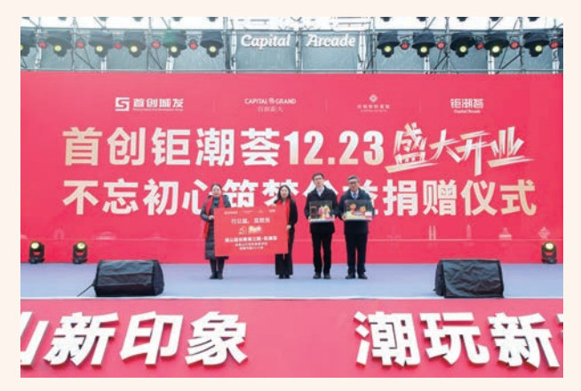
Opening ceremony of Kunshan Capital Arcade

In December 2023, Kunshan Capital Arcade under the entrusted management of the Company officially opened. Capital Arcade is a new product line incubated by the Company after ten years of deep cultivation on the outlets track. With the international trend as the main line, focusing on the introduction of experience formats and advocating a healthy and happy lifestyle, Kunshan Capital Arcade formed a complementary format with Kunshan Capital Outlets, achieving the scale effect of "1+1>2", and providing customers with a full range of high-quality and low-cost and multi-dimensional experiential consumption.