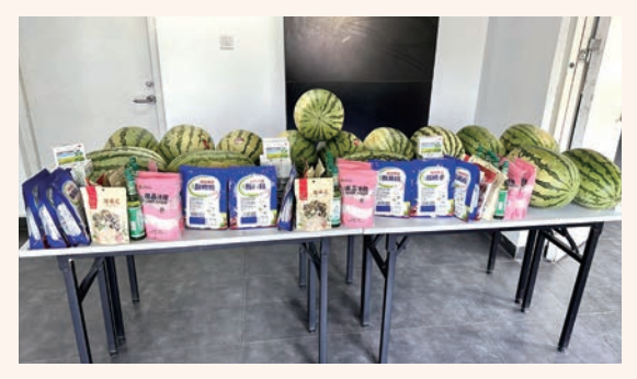
Summer Cooling Campaign Launched by Xi'an Capital Outlets