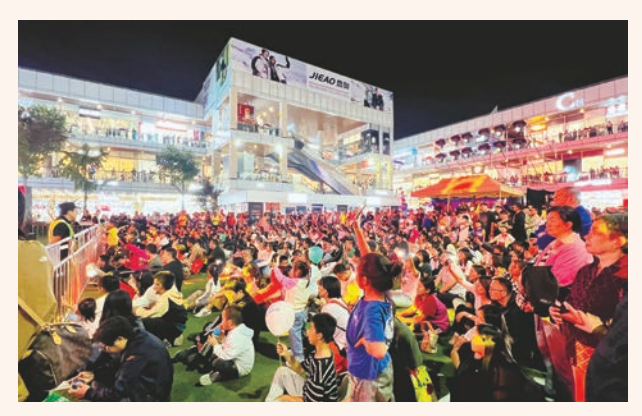
Shopping season events organized by Capital Outlets

During the May Day holiday period, Capital Outlets deeply cultivated and broadened the online and offline ecosystem, and carried out in-depth cooperation with Meituan and Douyin, attracting consumers to shop in malls by allowing them to purchase online and experience offline with group purchase coupons. By focusing on multimedia and full-matrix, Beijing Capital Outlets reduced the advertising placement on traditional media and increased online publicity, with a Douyin store visit video exposure traffic of 33 million+, and Chongqing Capital Outlets adopted a multi-line approach such as "Douyin store visit + Douyin live streaming + AutoNavi travel coupons" to create a one-stop convenient shopping experience, realize the expansion of new users and the activation of old users, promote the full-link transformation both online and offline, and help creating a young scene consumption ecology.