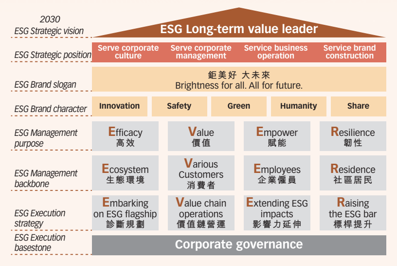
ESG Strategic Plan – the "Leading Program"