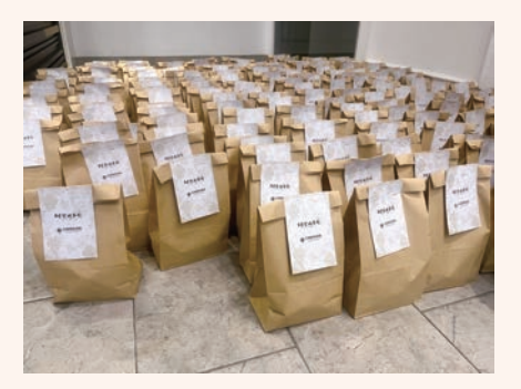
Dongzhou Grape Tourism Culture Festival