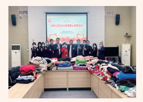
Love donation activity

Huzhou Capital Outlets has continued to carry out the "Love Travels Long, Warmth Interdependence (愛行千里、溫暖相依)" charity donation activity, donating more than 2,000 pieces of clothing and more than 100 books to regions such as Qinghai and Xining.