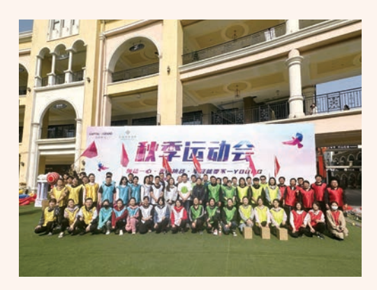
Autumn Sports Meeting Held by Jinan Capital Outlets