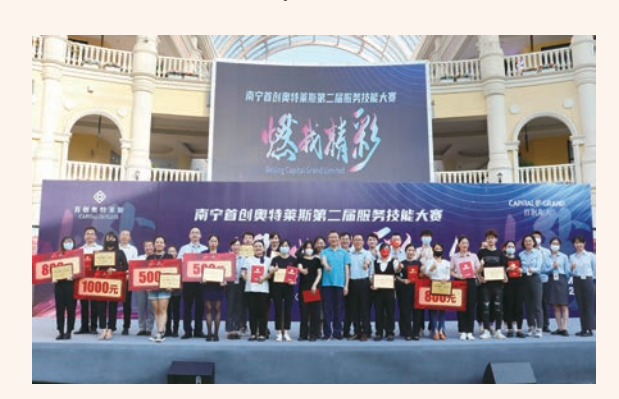
Service skills competition held by Nanning Capital Outlets

• Nanning Capital Outlets launched the second "Witness Me Wonderful (燃我精彩)" service skills competition with a theme of "Showing My Wonderful Skills". Nearly, in which nearly 800 contestants from the project staff and shopping guides participated. 8 contests were organized, such as Douyin Celebrity Contest (抖音達人競賽), Operation Knowledge Contest (運營知識競賽), etc, so as to guide the shopping guides of the stores to continuously strengthen the awareness and ability of live sales.