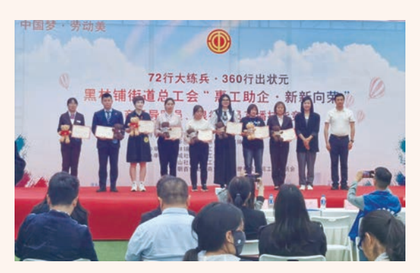
Award Presentation of shopping guides on skills competition of Kunming Capital Outlet

• Kunming Capital Outlets participated in the "Skills Training for 72 Trades – Best Performer from 360 Trades (72 行大練兵 • 360行出狀元)" of Wuhua district for employees in 2023, being a webcast salesperson skills competition organized by the Wuhua District Federation of Trade Unions in Kunming City, and the shopping guides of projects enthusiastically signed up to participate in the competition, of which 12 people were shortlisted, and 8 people won awards.