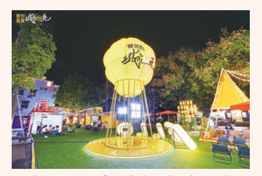
Outlets Bazaar of Capital Outlets in Wuzhen

In September 2023, Capital Grand built a "City Night Alley (首創奧萊城市夜巷)" in Wuzhen under Capital Outlets through cross-border cooperation, to explore the characteristic pop-up market of "Outlets + Bazaar (奥萊+集市)". With the self-operated CO fashion outlets collection store as the main body, the market introduced JD luxury products under JD Fashion, city night alley marketplace, "Xianfan Gathering (先番集薈)" and other special projects, providing consumers with a new "one-stop" shopping experience of eating, drinking, playing, and entertainment.