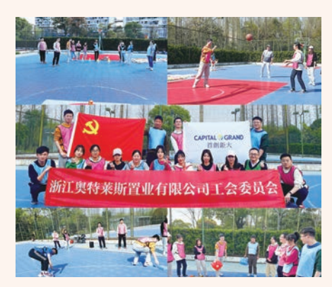
Fun Sports Meeting Organized by Huzhou Capital Outlets

Wuhan Capital Outlets: organized the "Party Building Leads Hiking, Working Together to Achieve Good Performance (黨建引領徒步走,同心協力沖業績)" themed hiking activities on the East Lake Greenway to enhance the physical fitness level of employees.