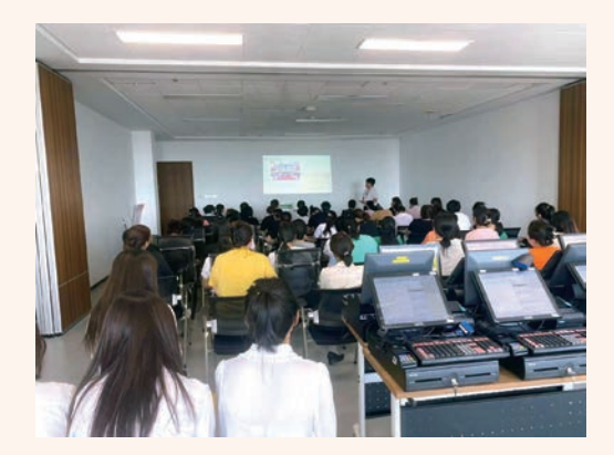
New Employee Training of Qingdao Capital Outlets

• Qingdao Capital Outlets regularly trains new employees in corporate culture, "Outlet" concept and service etiquette.