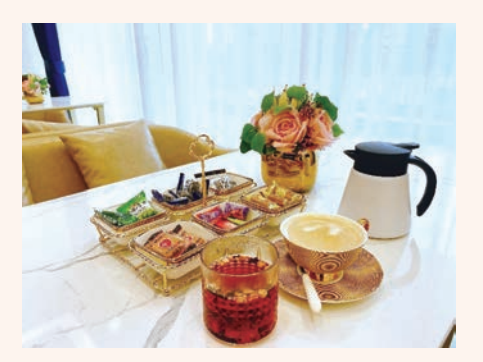
Kunshan Capital Outlets offered afternoon tea service for members