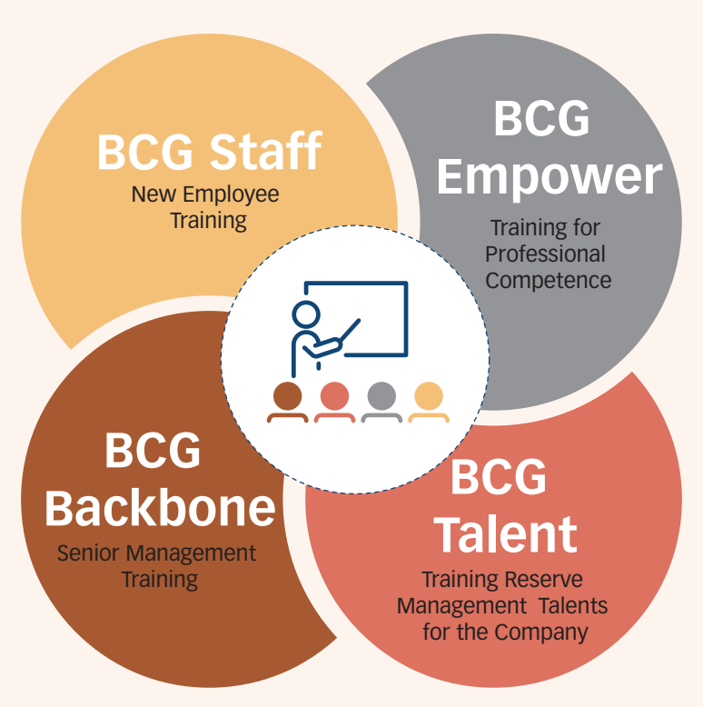
Four Major Talent Training Progression System of the Company

We attach importance to the personal growth and development of employees, improve the talent training system, carry out various forms of vocational training, combine training with business to achieve business breakthroughs and efficiency improvement, and achieve the accumulation and effective output of company knowledge, creating a learning organization that can improve in both teaching and learning and keep innovating, and providing strong support for the growth and development of employees.