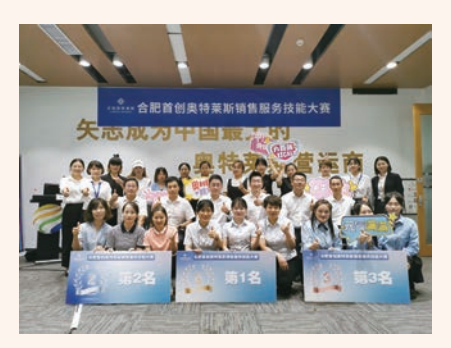
Skills competition held by Hefei Capital Outlets

• Nanning Capital Outlets launched the second "Witness Me Wonderful (燃我精彩)" service skills competition with a theme of "Showing My Wonderful Skills". Nearly, in which nearly 800 contestants from the project staff and shopping guides participated. 8 contests were organized, such as Douyin Celebrity Contest (抖音達人競賽), Operation Knowledge Contest (運營知識競賽), etc, so as to guide the shopping guides of the stores to continuously strengthen the awareness and ability of live sales.