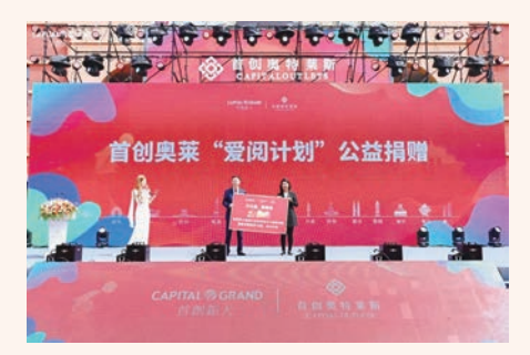
"Love Reading Plan" public welfare donation

Qingdao Capital Outlets, led by the "Love Reading Plan (愛閱計劃)", actively responded to the call for "Do public welfare, show responsibility (行公益 顯擔當)," donating 10 boxes of books and teaching aids to Qingdao Children's Welfare Institute, totalling 492 items.