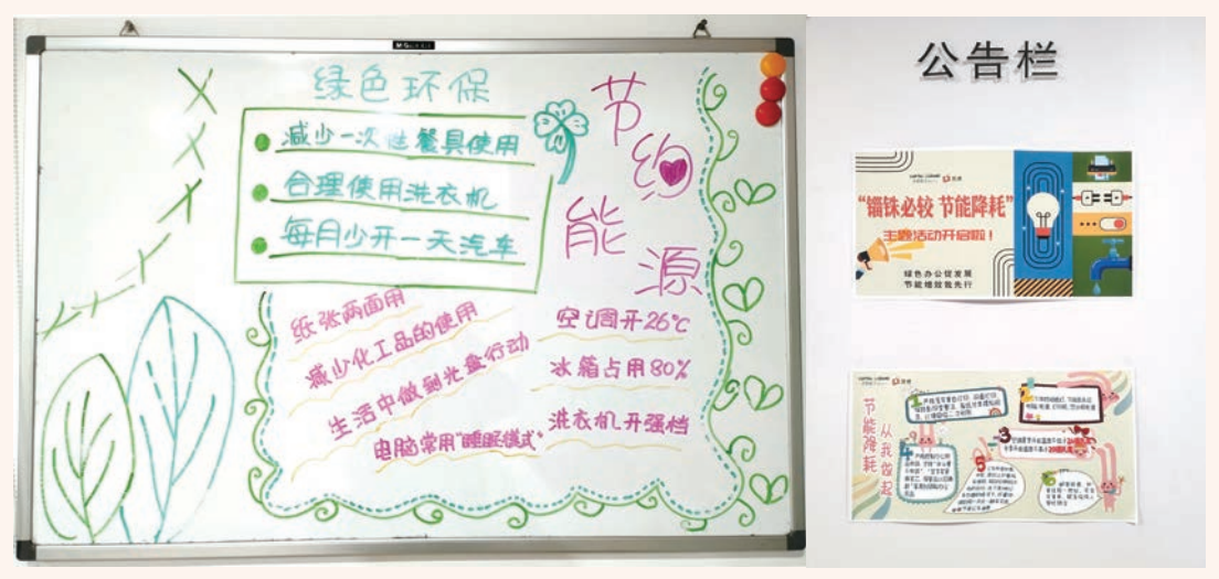
Promotion and display of energy saving in office areas

In 2023, Chongqing Capital Outlets launched the theme activity of "Energy saving start from small details (錙銖必較,節能降耗)", promoting and inspecting low-carbon printing in office areas, turning off lights during lunch breaks, strictly controlling the application of office supplies, and scientifically using buses. By utilizing energy-saving and consumption reducing measures, it cultivated employees' awareness of environmental protection and resource conservation, and promoted green office.