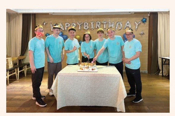
Staff Birthday Party Activity Organized by Nanning Capital Outlets