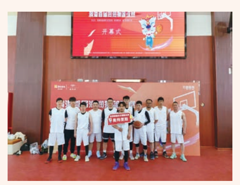
Community basketball game

• Xiamen Capital Outlets organized employees to participate in community basketball games, providing opportunities for nearby communities and businesses to participate and communicate together, enhancing connections with local communities, and establishing stable and intimate community relationships.