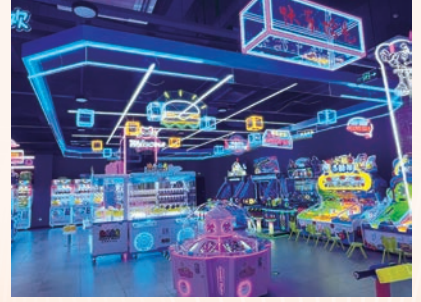
Happy Time POP Toy City was introduced in Chongqing Capital Outlets