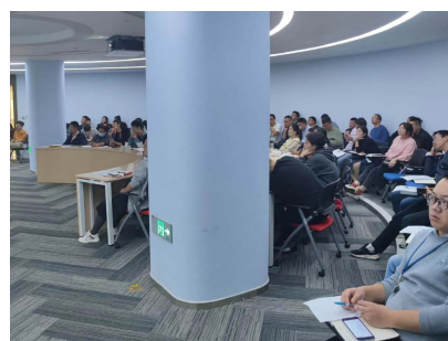
Occupational health training 職業健康培訓

No work-related fatalities occurred in each of the past three years, including the Year. During the Year, there were no lost days due to work injury in the Group.