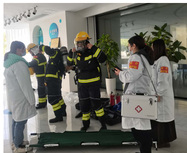
Fire evacuation drill 消防疏散演習