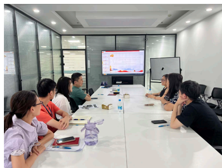
Employees' training 僱員培訓