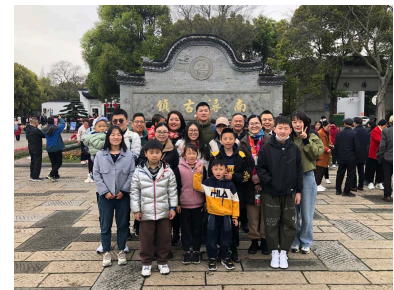
Family day activity 家庭日活動