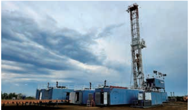
Drilling rig for new wells drilling