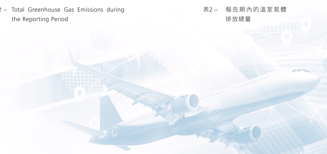
表2 – 報告期內的溫室氣體排放總量