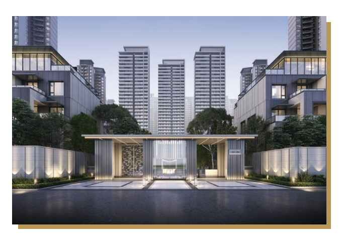
Zhongshan Yuhong Project