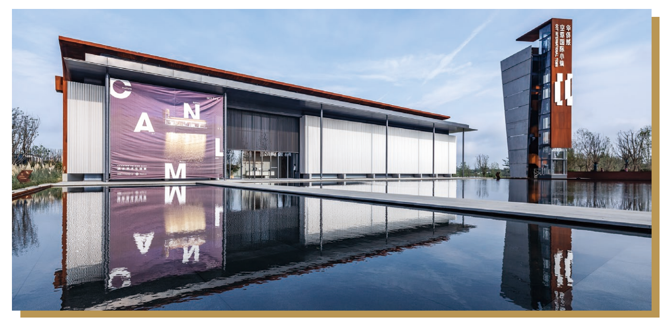
Innovation Demonstration Zone of Heifei Airport International Town