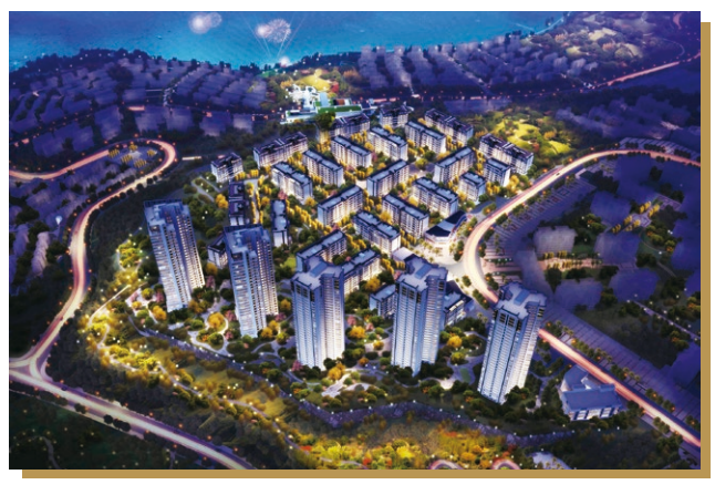
Chongqing OCT Land Project