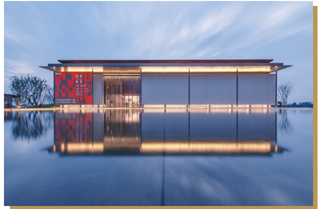
Innovation Demonstration Zone of Heifei Airport International Town