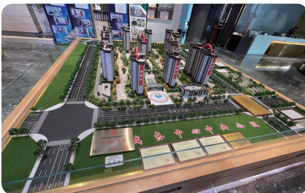
The development project model displayed in The Xixian Kangqiao Xueyuan project sale office

The Group complies with the Advertising Law of the People's Republic of China (《中華人民共和國廣告法》) and the related laws and regulations. Pursuant to Article 26 of the Advertising Law of the People's Republic of China, an advertisement on real estate shall contain true information on the source of real estate, with the area thereof specified as the gross floor area or the gross internal floor area, and shall not contain: (i) any commitment on appreciation or investment return; (ii) any indication of the location of the project by the time needed from the project to a specific object of reference; (iii) any violation of the state provisions on price management; and (iv) any misleading publicity on transport, commerce, cultural and educational, and other municipal facilities under planning or construction. In connection with the health and safety of the products and services provided, the Group has formulated the Housing Quality Warranty and User's Instruction Manual for Residential Housing to meet the relevant requirements.