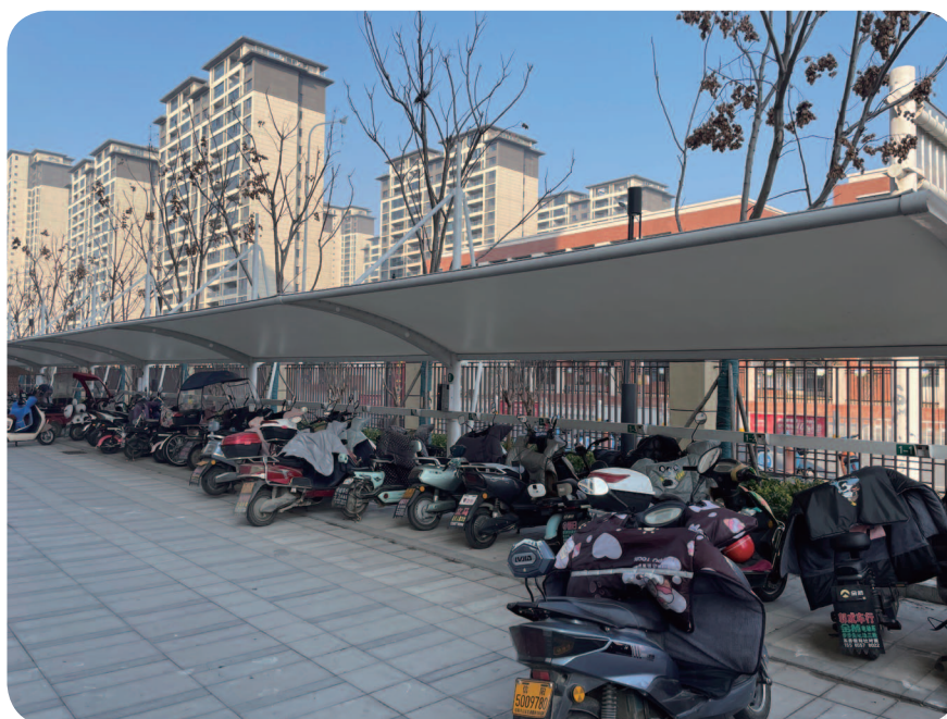
EV AC charging points located at The Xixian Kangqiao Xueyuan project