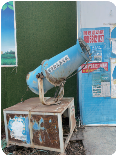
Dust suppression devices installed at various spots on site

In Year 2023, the Group was not aware of any material non-compliance with the relevant laws and regulations relating to providing a safe working environment and protecting employees from occupational hazards that have significant impact. The Group strictly complied with local laws and regulations relating to health and safety, such as Safe Production Law of the People's Republic of China (《中華人民共和國安全生產法》) and the Regulations on Work-Related Injury Insurance of the People's Republic of China (《中華人民共和國工傷保險條例》). In addition, there was no report of significant fines or sanctions as a result of non-compliance with relevant laws and regulations in Year 2023.