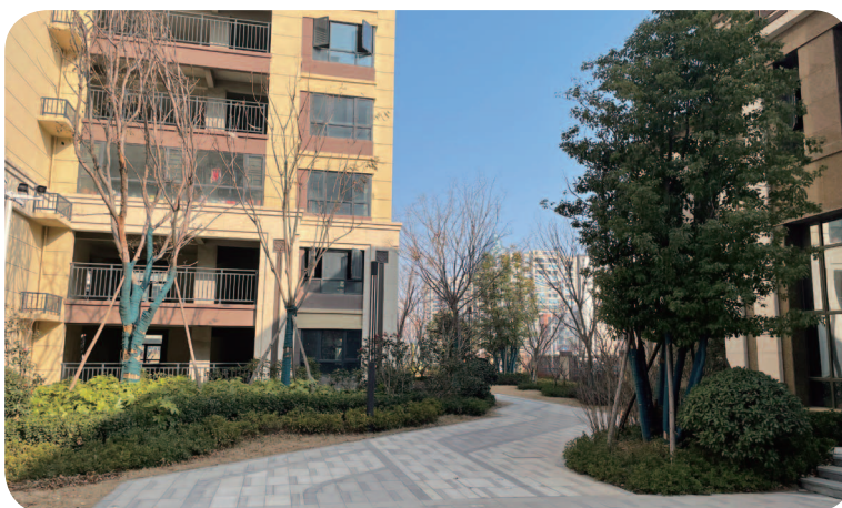
The podium garden of The Xixian Kangqiao Xueyuan project

Water from the ponds is used for irrigation, which in turn reduces the consumption of running water. As no exploitation of underground water is carried out within the completed gardens with built-in ponds, there is no change in groundwater flow field or groundwater level.