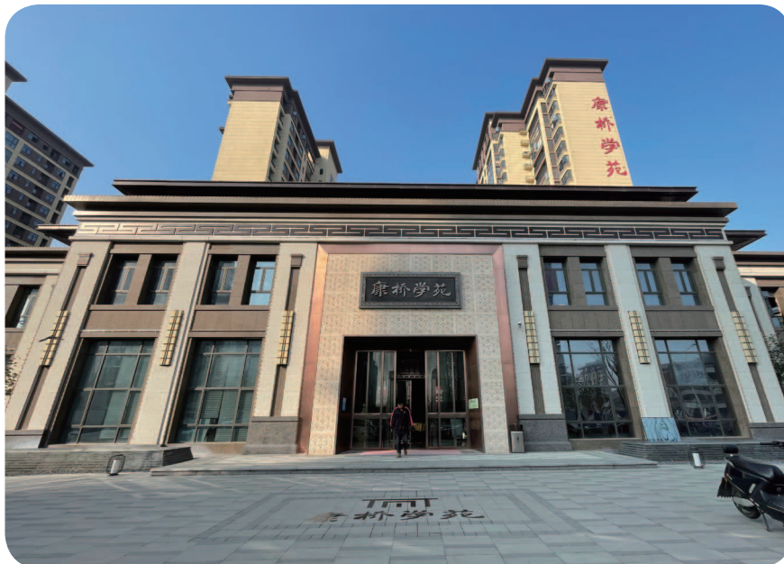
The Xixian Kangqiao Xueyuan project in Henan Province

The Group is committed to maintaining the sustainable development of its businesses and providing support to environmental protection and the community in which it operates. The Group manages its business in a prudent approach by following reasonable decision-making procedures to provide its clients with quality products and services. The Group maintains a close tie with its stakeholders, including shareholders, the government, employees, clients, suppliers, the community and the public, and strives to balance their opinions and interests through constructive communications in order to determine the direction of its long-term development. The board of directors is responsible for assessing and determining its environmental, social and governance risks, and ensuring that the relevant risk management and internal control system is operating properly and effectively.