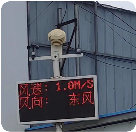
Air quality monitoring system installed on site