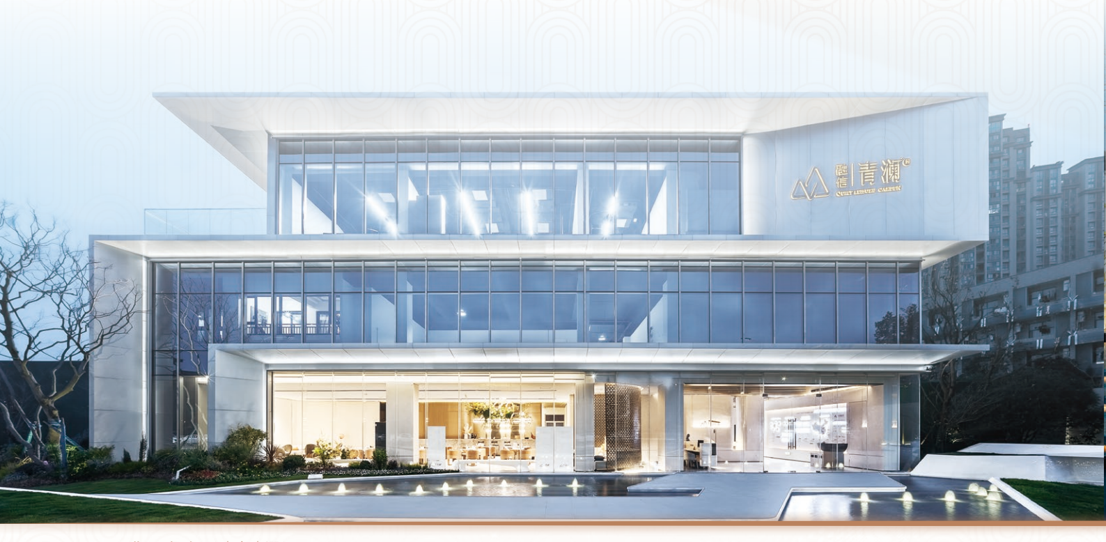
Nanjing Qinglan (南京青瀾)