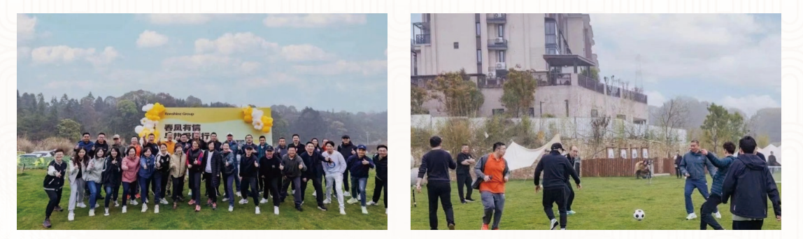
A soccer game during the Spring outdoor group building session

An outdoor team-building event themed "Remembering and Growing Up with Ronshine" was held at the Fuzhou Youshu Daydream Camp, offering our employees a chance to reflect on past challenges and enhance their comprehension of our vision and culture.