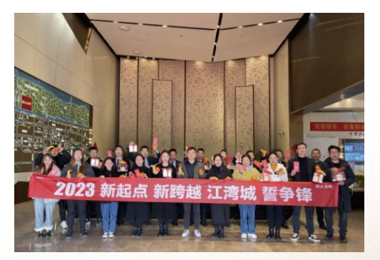
Staff of Ronshine's Henan Branch at the New Year Work Commencement Ceremony

Ronshine cares sincerely for its employees. After the Spring Festival holiday, Ronshine extended its New Year blessings to the frontline employees by presenting them with cakes and greeting cards, inspiring them to eagerly embrace new challenges of the forthcoming year.