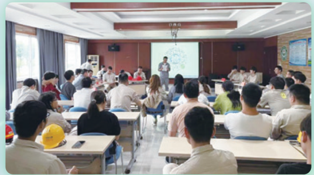
The “Safety Production Month” activity of Anji Power Plant 安吉電廠「安全生產月」活動現場

In order to enhance the safety awareness of all employees and ensure effective response to emergencies which may cause safety risks, the Operating Stations also formulated the emergency plans, such as “Emergency Plan for Fire Safety Incidents”, “Emergency Plan for Emergency Environment Incidents”, “Emergency Plan for Production Safety”, “Emergency Plan for Typhoons, Floods and Strong Convection” and “Emergency Plan for Power Failure”, and carried out drills and provided the employees with relevant safety training on a regular basis. During the Year, the Group has carried out a total of 38 activities, such as emergency drills, Safety Awareness Month and Fire Drill Day, which include several topics such as typhoon and flood prevention, natural gas equipment leakage emergency drills, fire emergency evacuation, and power failure emergency drills, with more than 1,100 participants.