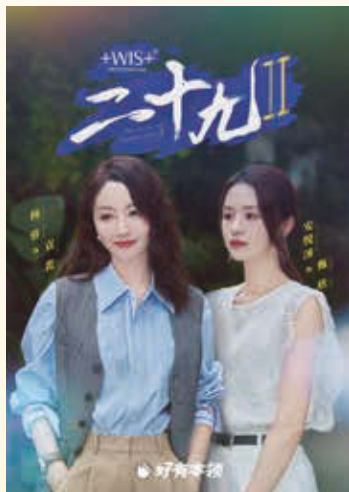
“Twenty Nine” Season 2 《二十九》第二季