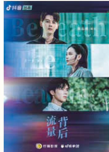
“Beneath the Headlines” 《流量背後》