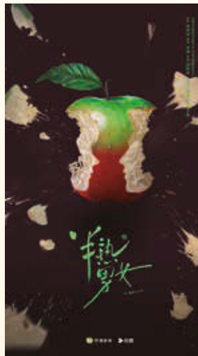
“In Between” 《半熟男女》