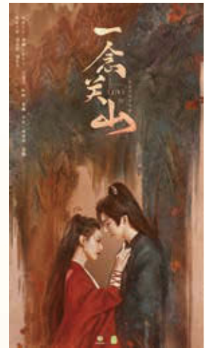
“A Journey to Love” 《一念關山》