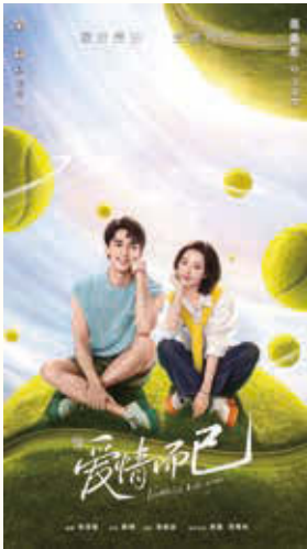
“Nothing But You” 《愛情而已》