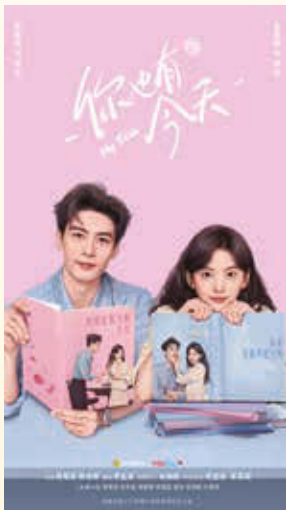
“My Boss” 《你也有今天》