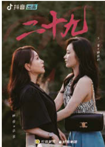
“Twenty Nine” 《二十九》