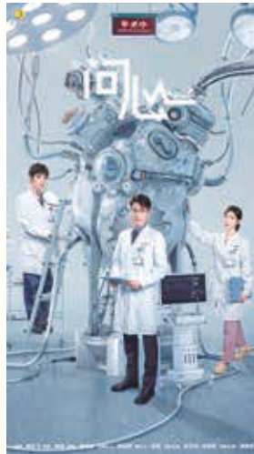
“The Heart” 《問心》