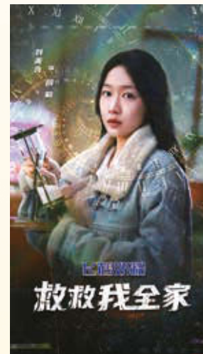
“Save My Whole Family” 《救救我全家》