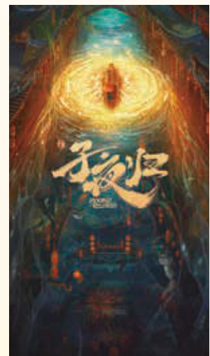
“Moonlit Reunion” 《子夜歸》