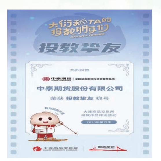
"Investor Education Companion" by Dalian Commodity Exchange