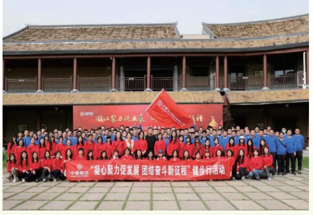
"Promoting Development with Concerted Efforts, Striving for a New Journey" walking event