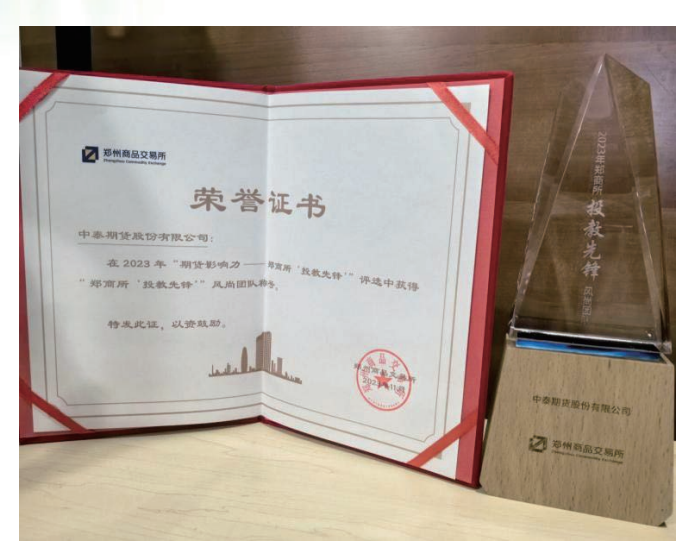
"Investor Education Pioneer" by Zhengzhou Commodity Exchange

In the assessment of national securities and futures investor education bases in 2023, the investor education base of Zhongtai Futures was rated as "excellent" by the CSRC.