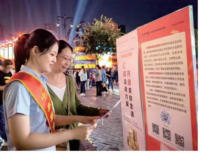
2023 Month of Education and Publicity for Protection of Rights and Interests of Financial Consumers at the Zhongtai Futures Investor Education Base

In 2023, the innovative and distinctive investment education activities organized by the Company, such as the "Investor Education Caravan along the Yellow River," the "Moon Worship Ceremony during Mid-Autumn Festival" and the "Investor Education Activities in Inner Mongolia" received positive responses.