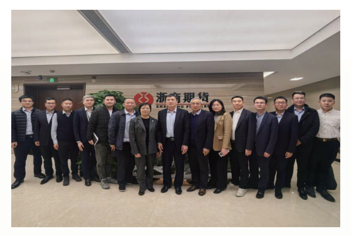
Extensive study and research – Benchmarking against our peer "Zheshang Futures"

In 2023, the Company carried out in-depth education on studying and implementing Xi Jinping's Thought on Socialism with Chinese Characteristics for a New Era. We regarded conducting extensive study and research as an important part of the thematic education. Based on the "Benchmarking and Striving for Excellence" initiative, we organized the Company's leadership members to adopt a problem-oriented and goal-oriented approach, resulting in the production of 18 thematic research reports, which facilitated the implementation of effective measures to promote business development, such as transforming the operational entities to enhance their professional service capabilities through the "Research+" model and creating a comprehensive customer service system with continuous support. Furthermore, the theoretical study group of the Company's Party committee held 12 learning activities, with more than 380 discussions on the "first topic", over 330 "three meetings and one class" sessions, and more than 70 thematic party activities, thereby continuously strengthening the ideological preparation of the Party with innovative theories.