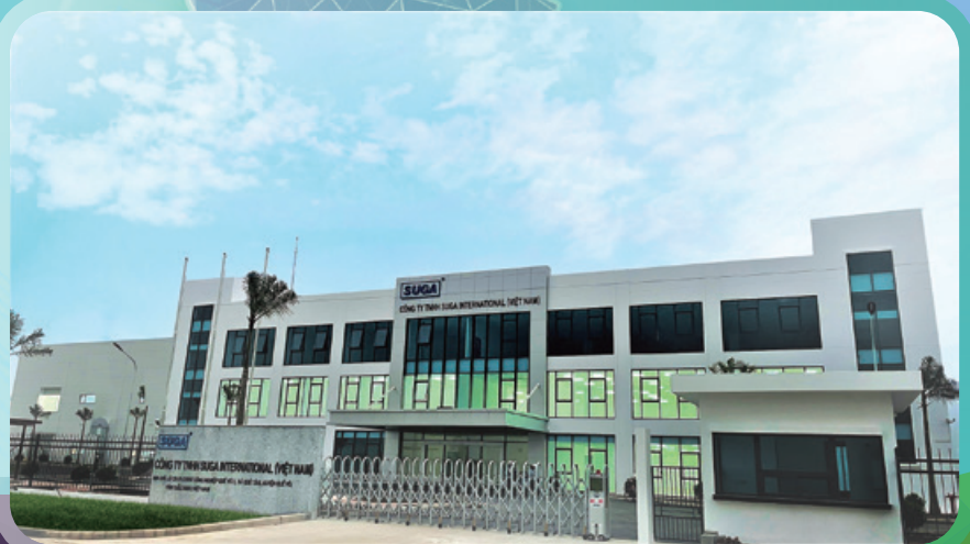
Factory in Vietnam 越南廠房