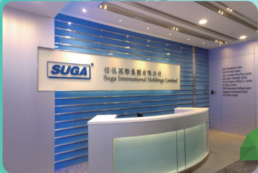
Headquarter in Hong Kong 香港總部