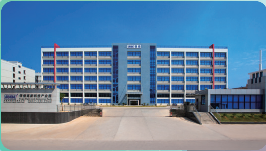
Factory in Dong Guan 東莞廠房