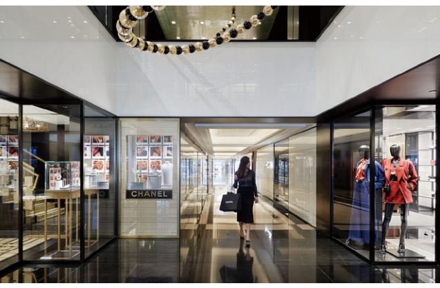
THE PENINSULA SHANGHAI 90,005 | 50%