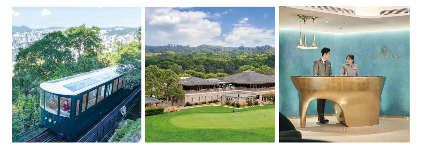
PENINSULA MERCHANDISING Established: 2003 100%

PENINSULA CLUBS AND CONSULTANCY SERVICES Established: 1977 100%