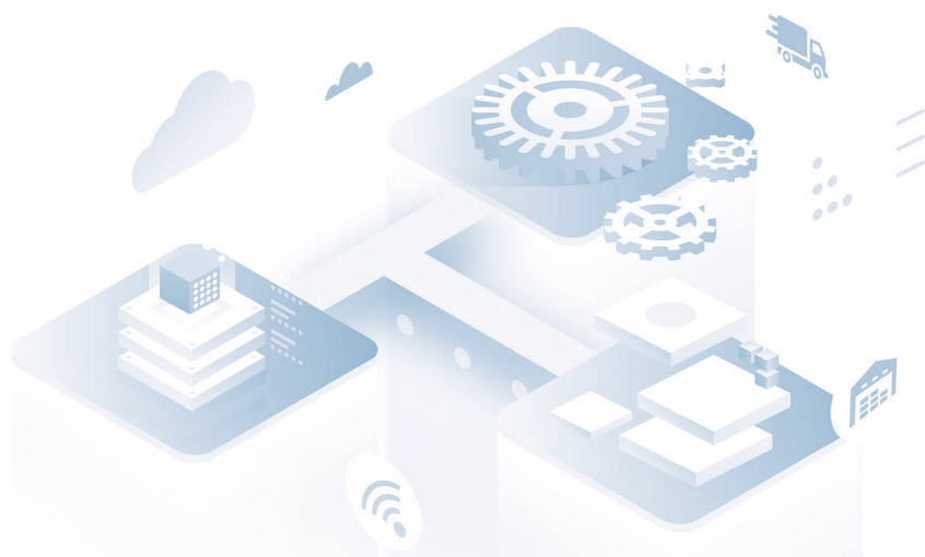
Table of Contents 目錄