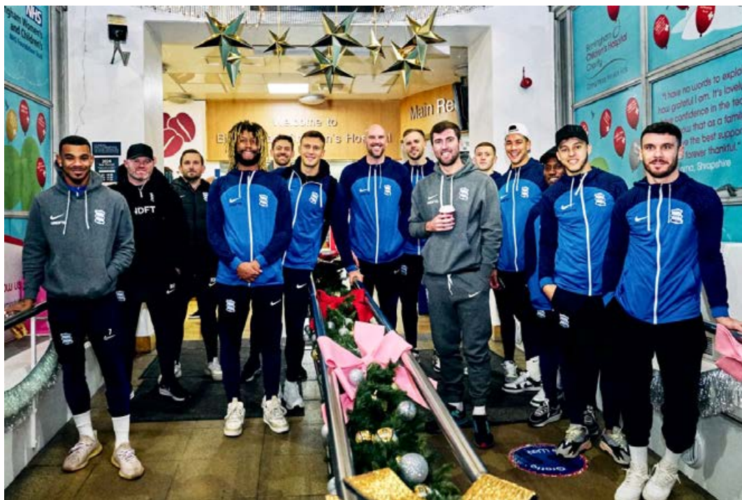
Members of the Men's First Team toured the United Kingdom's leading specialist paediatric centre in December 2023. 男子足球一隊成員於2023年12月參觀了英國頂尖的兒科專科中心。

BCFC基金會為合作學校提供全職足球學院教練，以加強對青少年的教育。有關課程包括導師指導、算術及識字支援、體能教育、足球訓練、針對性介入及教牧關懷。導師指導是整個計劃的關鍵部分，而BCFC向年輕人展示出只要用心，彼等均可成就遠大的夢想、實現高遠的目標以及克服重重的障礙；同時亦協助年輕人訂立目標，建立個人發展計劃。