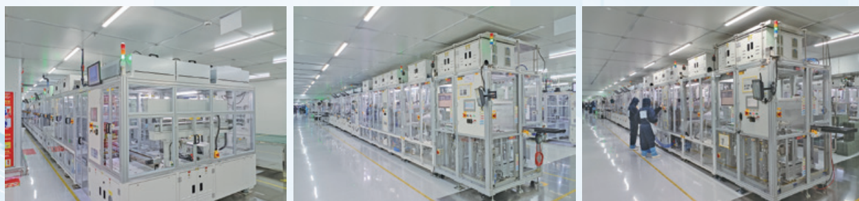
Two new medium-sized production lines completed during the year

During the Review Period, driven by the significant increase in sales, the Group recorded a gross profit of RMB196.3 million, representing a year-on-year increase of 12.8% with a gross profit margin of 4.3%. In addition to the expansion of business scale, the Group benefitted from a reduction in realised losses on derivative financial instruments (such as forward currency contracts for hedging the Group's foreign currency exposure) by approximately RMB50.0 million. As a result, The Group recorded a profit attributable to owners of the parent of RMB66.0 million, representing a year-on-year increase of 404.2%.