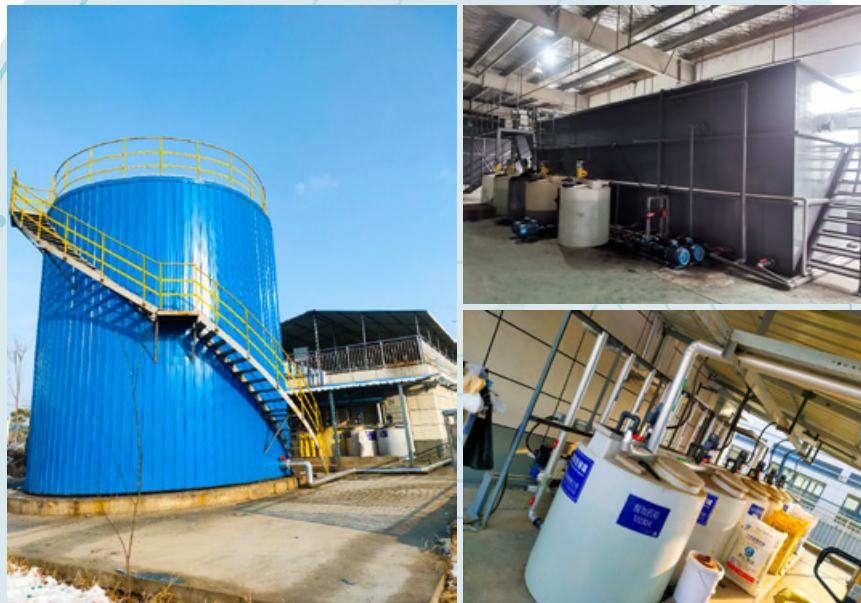
Sewage Treatment Facilities 廢水處理設施

本集團獲得當地政府的污染物排放許可證，並按照《污染源自動監控管理辦法》，於廠房設置污水處理站及在綫監控系統，當地生態環保局皆能透過信息發布平台，隨時監察氨氮排放量和化學需氧量的數據；而且定期委託合法檢測機構檢測廠房各排放口的廢水，內容包括水質酸鹼值、懸浮物、化學需氧量、五日生化需氧量、氨氮、總磷及動植物油，本集團於報告期內的檢測結果均符合國家的《水污染物排放限值》及《電鍍污染物排放標準》。地方環保部門除了透過線上監測設備即時監測廢水含污量外，亦會每年不定期對廠房的排污情況進行檢測；於報告期內，本集團未有收到有關部門任何廢水超標排放的通知。