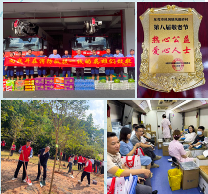
Various Volunteer and Donation Activities 各種義務與捐贈活動

本集團深明責任無處不在，應當對自己負責、對家人負責、對企業負責、對社會負責，重視企業形象與社會責任，並以「以人為本、履行社會責任」的管理方針，積極追求回饋及貢獻社會。本集團向來依法經營納稅，不遺餘力地協助解決當地的就業壓力。本集團為員工好好計劃退休生活作準備，為國內業務員工繳納五險一金，香港業務員工參加強積金計劃。本集團一直保持良好的生產經營、積極推行綠色環保理念及營造良好的發展秩序，在保持社會穩定及建設和諧社區方面，有一定的貢獻。於報告期內，本集團捐贈人民幣一萬多元給鳳崗敬老院及愛心助學項目的學生；於「八一」建軍節慰問消防救援隊伍與捐贈物品；參加引領鄉村綠化「六個一」行動捐贈及種植樹苗；以及組織四十位員工參與無償獻血活動。